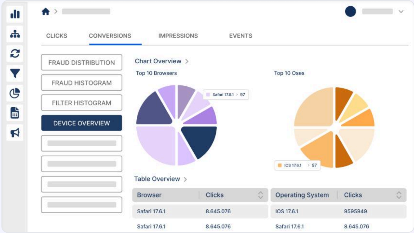
Real-time dashboard: Performance metrics & fraud alerts.

We integrate with many Affiliate Tracking Platforms including Hasoffers, Everflow, Affise and our own newly launched platform Integr8.co that uniquely combines Fraud Prevention and Tracking unlike any other system in the market.