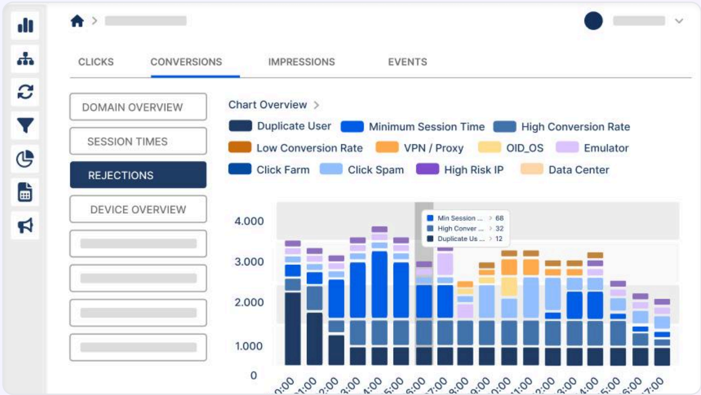
Detailed rejection analysis for transparent client communication.